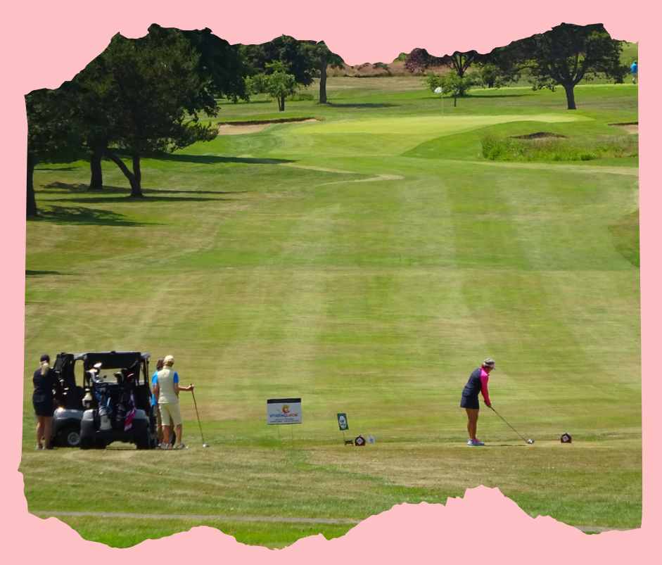
Ladies' Invitational 2023

The next exchange is at Camaloch on August 24. Sign up is in the ladies locker room. You must be in the Ladies Club to compete.